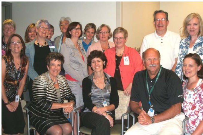
The PRHC GAIN team and its partners